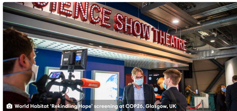
World Habitat 'Rekindling Hope' screening at COP26, Glasgow, UK

Given the success of World Habitat and AKAH's ex Change collaboration, the organisations have agreed to continue their engagement and partnership in the coming years.