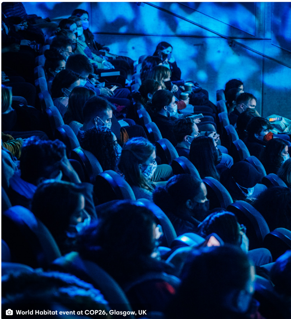
World Habitat event at COP26, Glasgow, UK

activities, encourage adaption measures to keep people safe from the inevitable threats caused by global temperature increases. We are conscious of the huge amounts of greenhouse gases emitted from the construction of homes and their ongoing use. Our work at COP26 demonstrated to us the huge decarbonisation task that our partners face. We think that despite the challenges there is a route to a faster decarbonisation of housing, and the social housing providers can provide leadership and demonstrate what can be achieved. We will carry out or commission research and use our influence to encourage a more rapid decarbonisation of social housing.